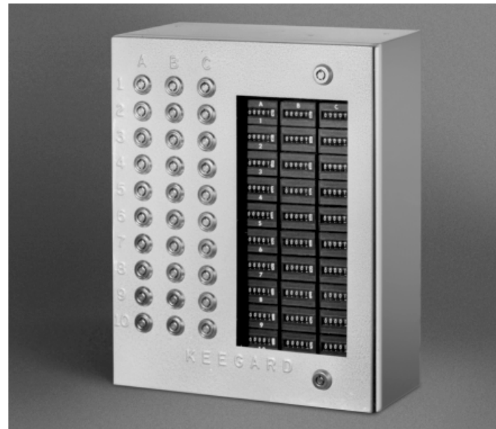
Above: Keegard Model K-095 shown with visible counter option Below: Also available with weathershield option

Installation is flexible and simple. The Keegard unit may be mounted, either in close proximity to the pump, or mounted remotely. Keegard is adaptable to most existing standard or commercial fuel dispensers, fitted with pulser kits available from OPW Fuel Management Systems, eliminating the need to buy a new pump.